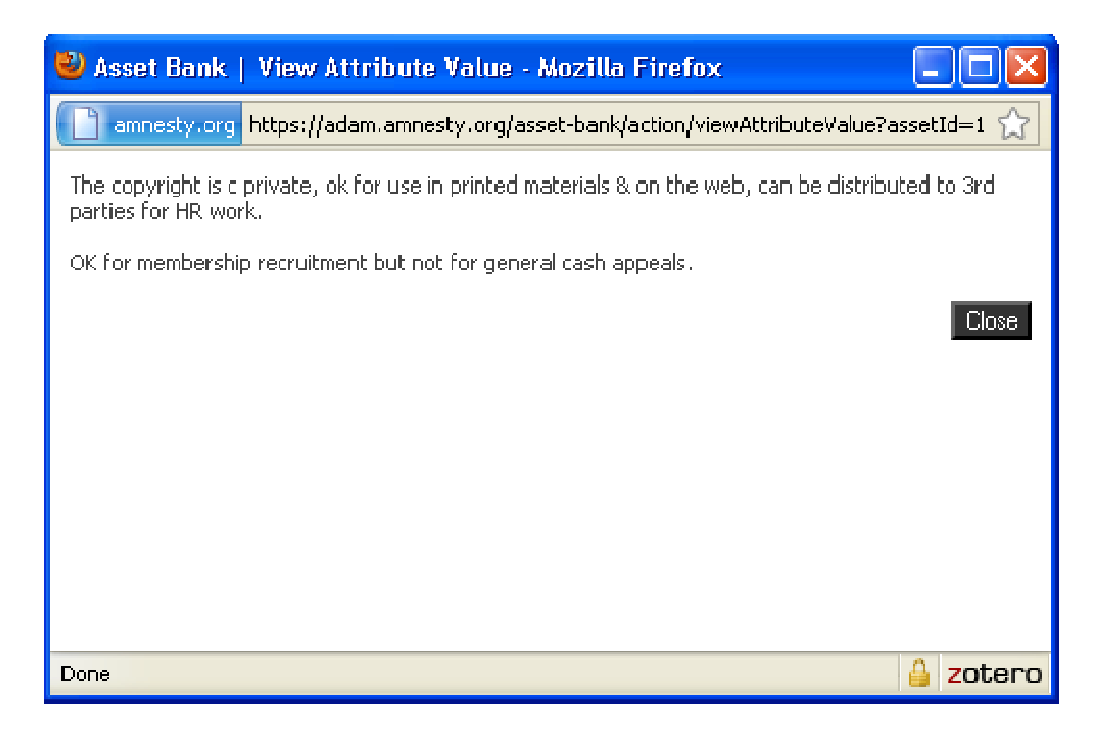
Figure 2: Agreement Notes found under "Read more>>" link within an item record. 17

• <u>Documents</u> associated with the video or image submitted and stored within the Al intranet, thus outside users cannot access this information