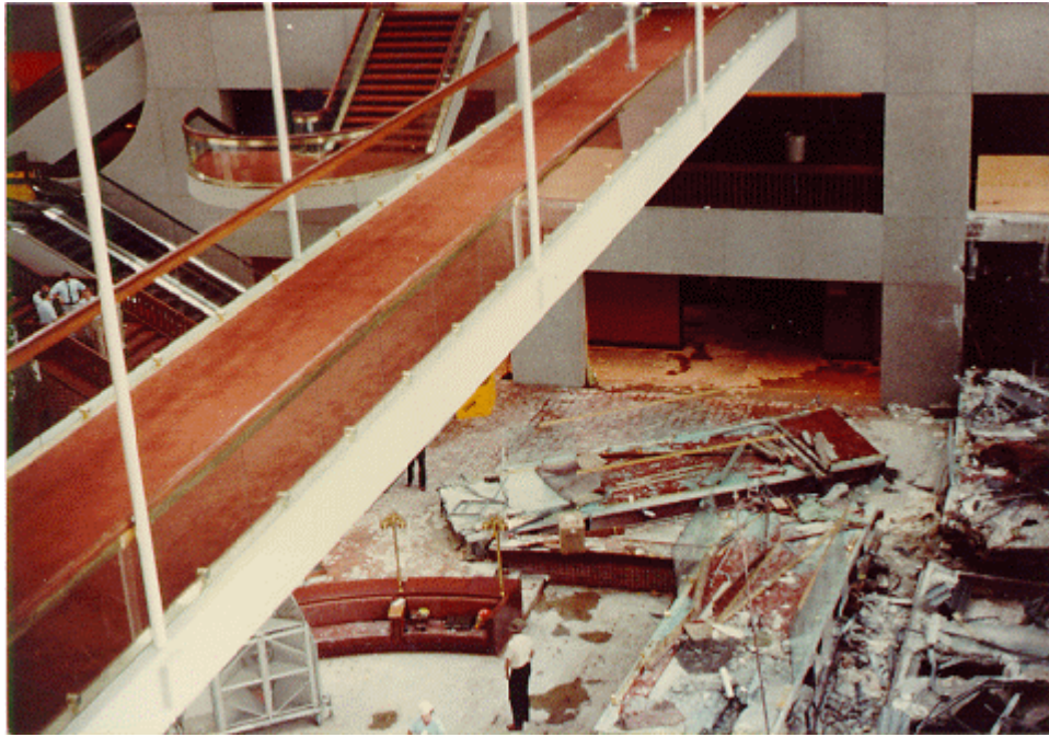
As of July 18, 1981 from https://commons.wikimedia.org/wiki/File:Hyatt_Kansas_City_Collapse.gif