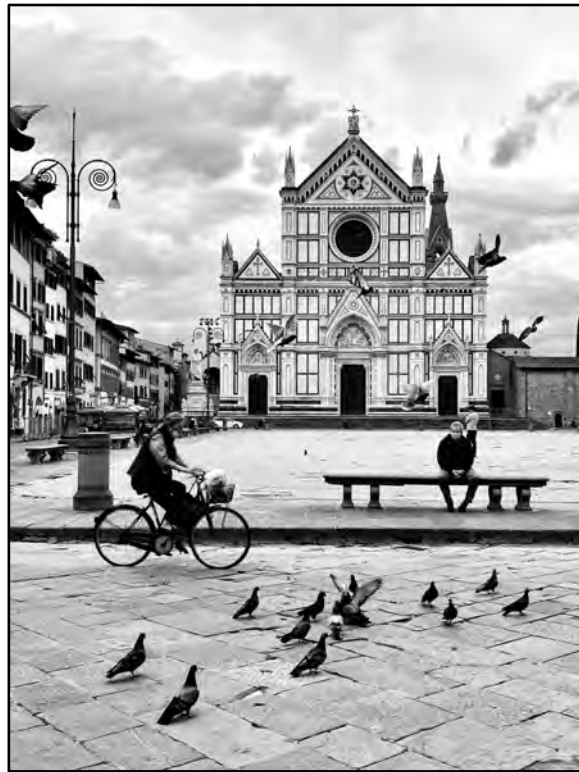
Piazza Santa Croce, Florence, 2020