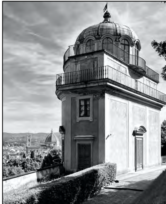
View from Boboli Gardens, Florence, 2020