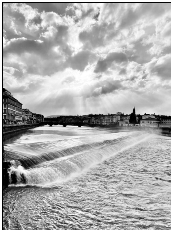
Pescaia di Santa Rosa, Florence, 2020

In conclusion, the New Shape of Sharing: Networks, Expertise, Information online forum provided a platform for collectively teasing out some key areas for potential collaboration for European studies librarians and the vendors and publishers that they work with. Together, we established objectives of creating diverse collections representing the range of political, cultural, linguistic, and scientific production of Europe's past, present, and future; responding to the opportunities of digital resources and new research methodologies; and especially, reaping the multiple benefits of working together to achieve these goals. We hope to continue these discussions with smaller working groups, concrete projects, and increased communication between librarians and vendors in both Europe and North America.